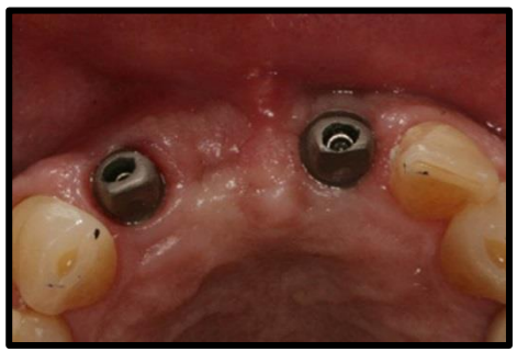
Fig. 6: Abutment in Situ