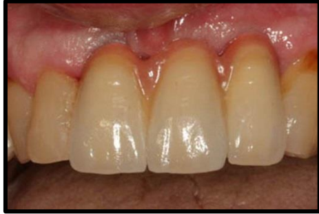
Fig. 7: Cement retained - zinc phosphate